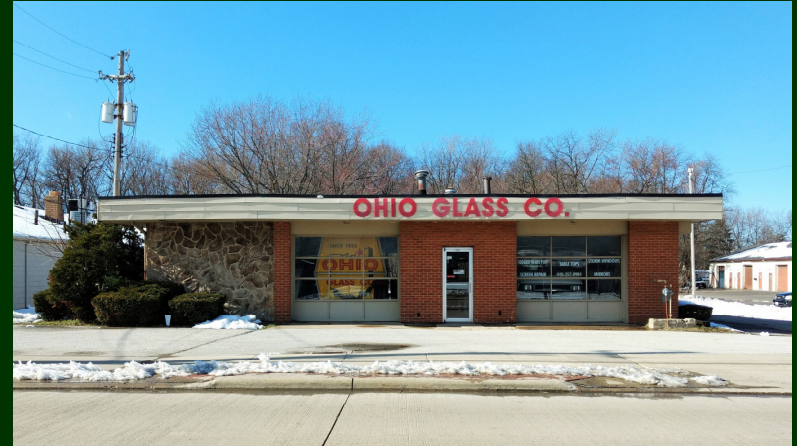
1388 Mentor Ave., Painesville Twp., OH

No warranty or representation, express or implied, is made as to the accuracy of the information contained herein. It is submitted subject to errors, omissions, price changes, rental or other conditions, withdrawal without notice, and to any special listing conditions imposed by our client.